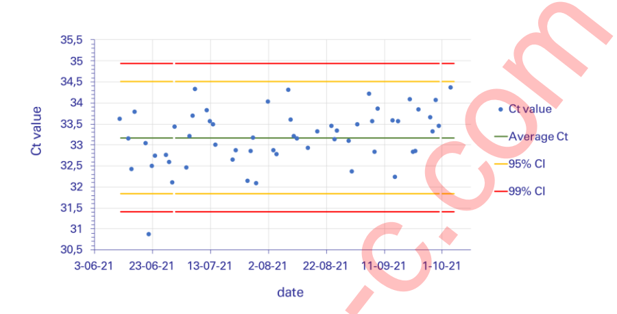
Figure 3. Levey-Jennings chart of Ct values in Roche cobas WNV assay on P0247 WNV Check 125 Control observed in 57 test runs on the cobas 8800 instrument during three months

Hence for monitoring the performance of the cobas WNV assay one can use untransformed Ct values in a Levey-Jennings QC chart for trend analysis and apply the Westgard rules 16.