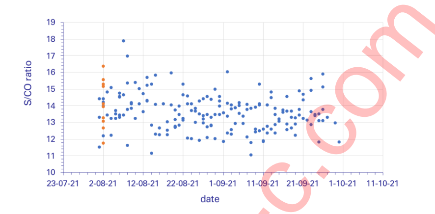
Table 5. Average (and range) of S/CO values found on P0247 WNV Check 125 Control with 5 Panther instruments